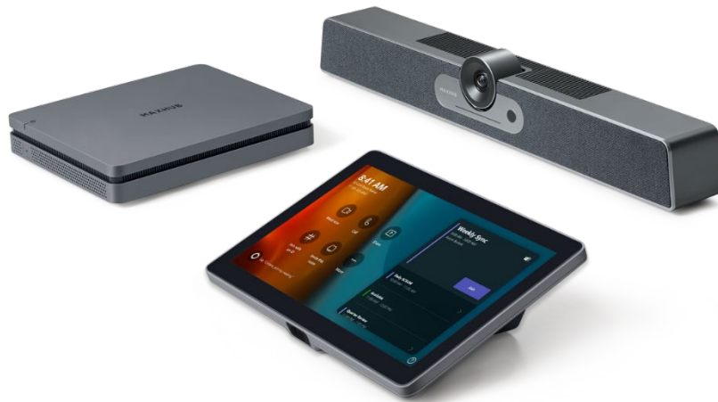
Picture: XT10-VB Kit