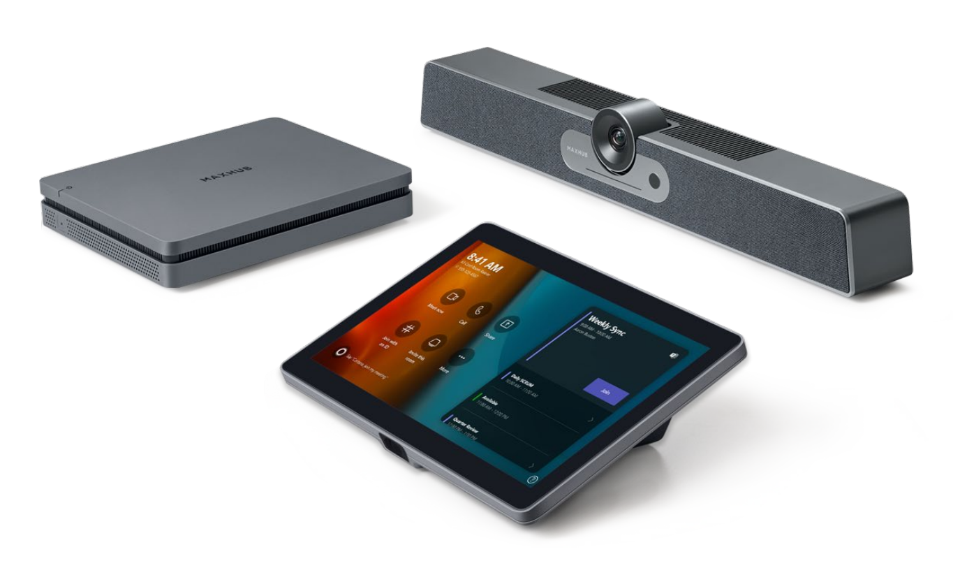
XCore Kit - XT10-VB Kit and display option from CMA Series to UW series 21:9

The BYOM capabilities with the TOGGLE and with the TOGGLE ROOMS are suitable with the following MAXHUB MTR Solution- MAXHUB XT Series for Microsoft Teams Rooms: