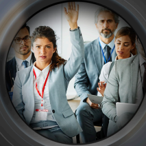
Audience interaction AI USB camera 2