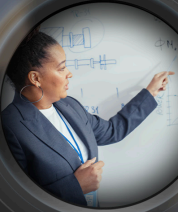
Presenter HDMI camera 1