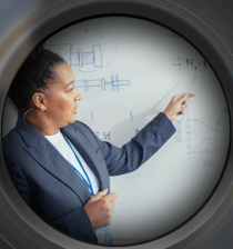
Presenter HDMI camera 1