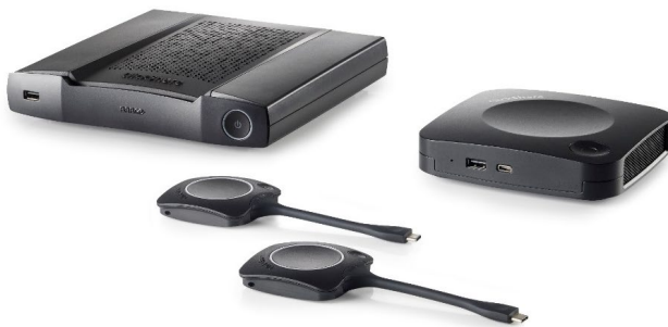
Barco ClickShare Conference System

Wireless conferencing and presentation systems, such as BARCO's ClickShare Conference (CX-20, CX-30 and CX-50) , offer a hassle-free means of providing a more enhanced meeting, collaboration and learning environment for participants. Users can easily "plug and play" their devices to the system without the headaches, making BYOD more of a breeze. But to switch the system to the laptop videoconference system, you need the TOGGLE, to transfer all USB devices to the laptop via Barco ClickShare. You just need to click on the PAD system (because the TOGGLE is controllable by RS-232) or use the TOGGLE push button switch.